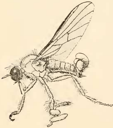
Fig. 1.— Rhamphomyia scaurissima ♂.

Male (Fig. 1).—Black. Face very broad for a male, with a few bristles along either orbit. Antennæ velvety black; first and second joints with rather stout hairs; first joint short and cylindrical; second joint spherical; third joint cylindrical, gradually tapering to a bluntly rounded tip, on which the short style is inserted. Palpi slender, black, with prominent black hairs. Proboscis as long as the head, yellowish at the tip, labella fuscous, hairy; bristles of the front and hairs of the posterior and inferior orbits prominent, black. Thorax opaque, dusted with gray, especially on the pleuræ and just in front of the scutellum; bristles prominent, confined almost exclusively